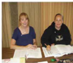
Volunteer and help someone else feel good about their self

ADULT READING PROGRAM CALL 735-7323 TO PRE REGISTER