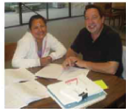
Volunteer and feel good about yourself